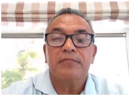
Hon. Orlando Habet Minister of Sustainable Development, Climate Change and Disaster Risk Management, Government of Belize providing the welcome address