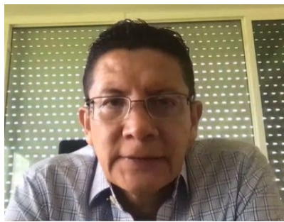
Hon. Christopher Coye Minister of State in the Ministry of Finance Economic Development and Investment, Government of Belize offering opening remarks